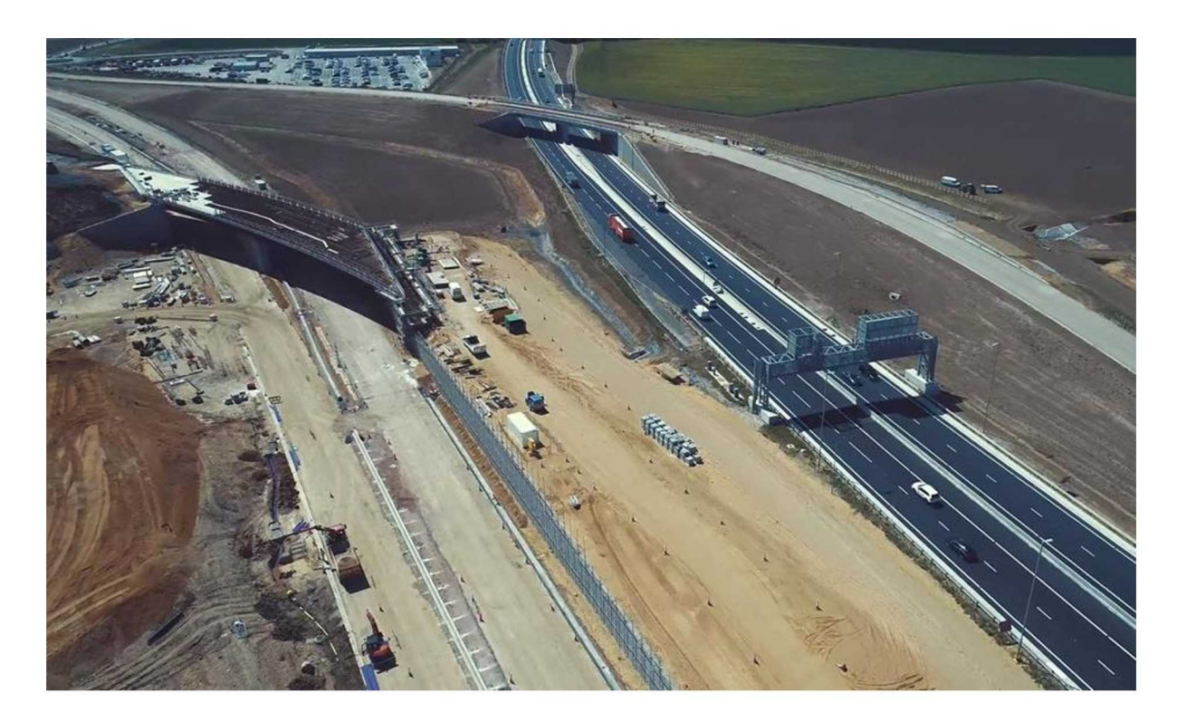
Section 3: Mainline surfacing of the Huntingdon southern bypass is progressing well and should be completed in late summer. Surfacing on the bridge over the East Coast Mainline railway is complete, allowing site access to Brampton. Highway communications works are well underway with ducting and gantry installation continuing across the section.

We have laid the foundations for safety barriers and traffic signs throughout this section of the scheme and the cultivation and seeding of embankments and verges has been progressing well. Tree, shrub and hedge planting will resume in September.