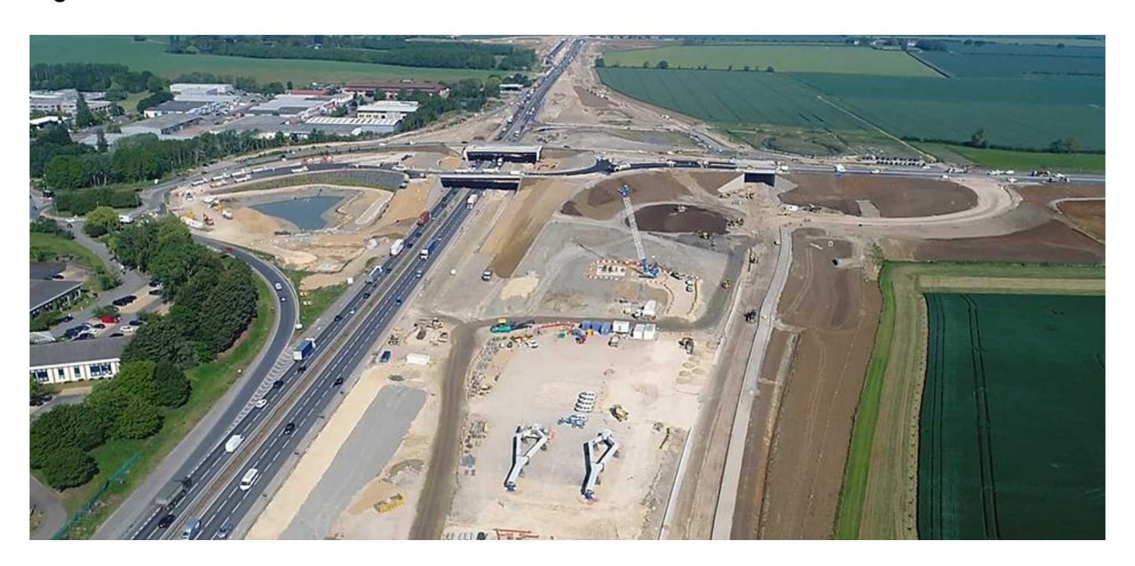
Section 6: Preparatory works continue here. Completion of archaeological investigations on Mill Common has allowedutility companies to start protecting or diverting their assets in this area. On the west side of Huntingdon, top soil stripping has begun and a Virgin Media asset has been installed.

Following agreement with the local authority, piling works beside Impington bridge, adjacent to the guided busway will take place during daytime hours rather than at night. This will start soon.